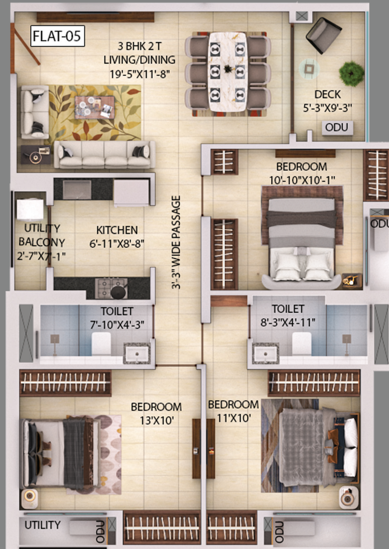
TOWER C - FLAT 5