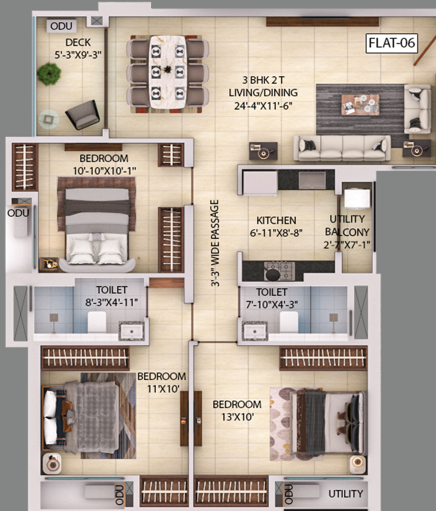
TOWER C - FLAT 6