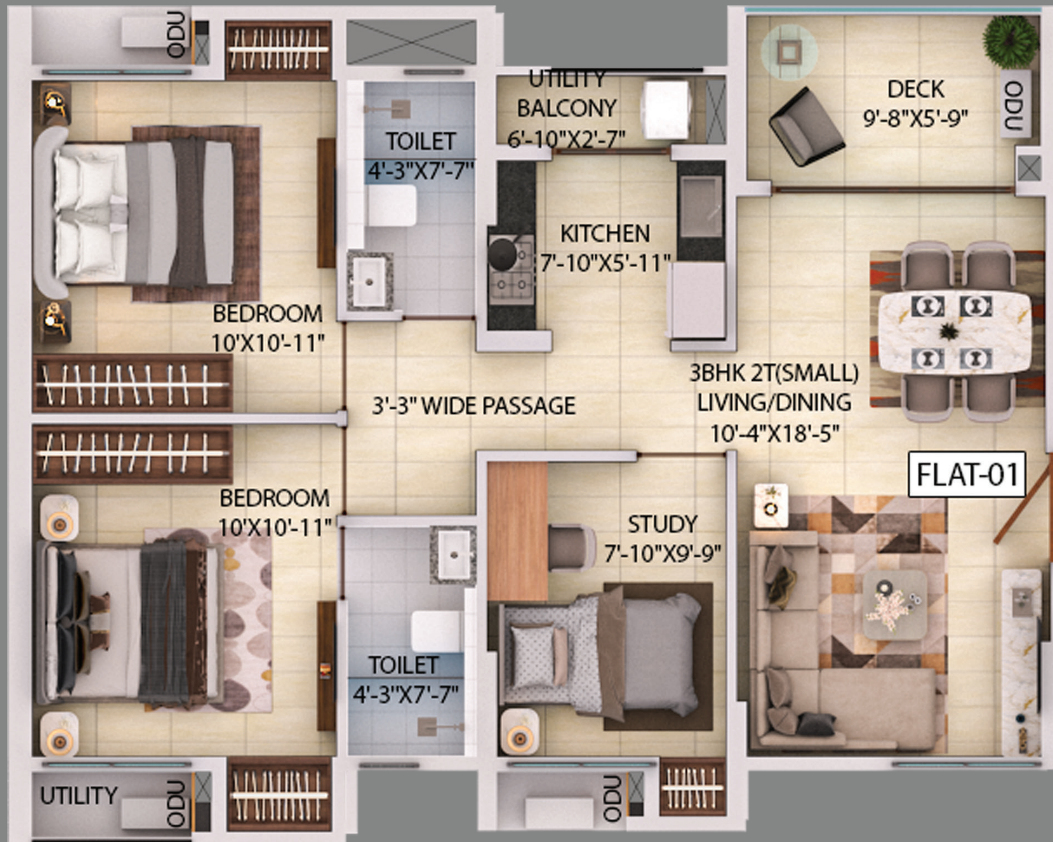
TOWER C - FLAT 1