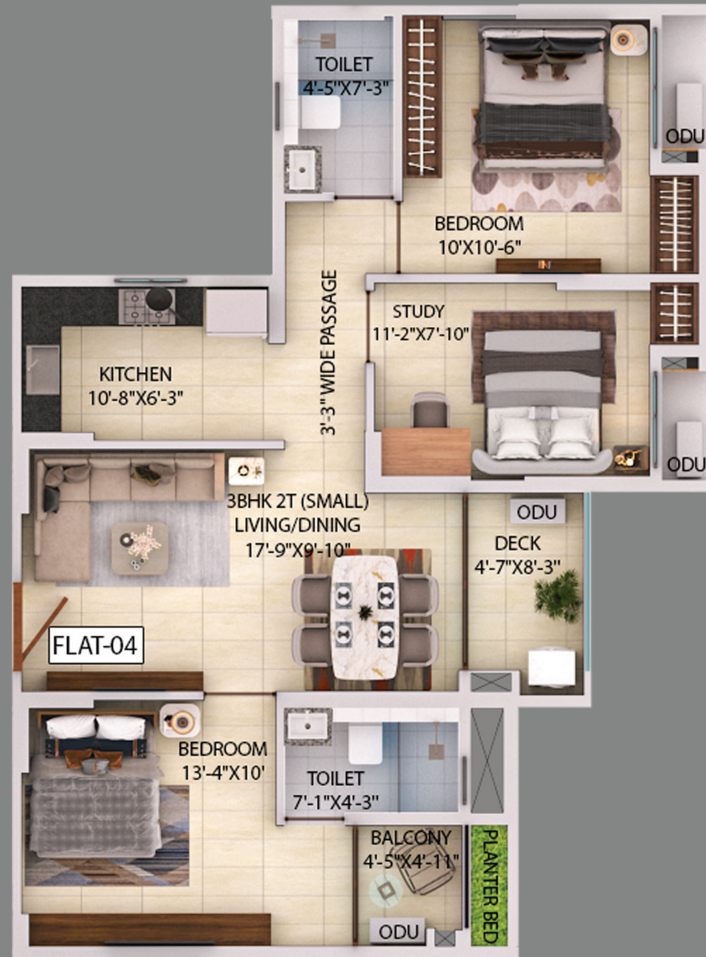
TOWER C - FLAT 4