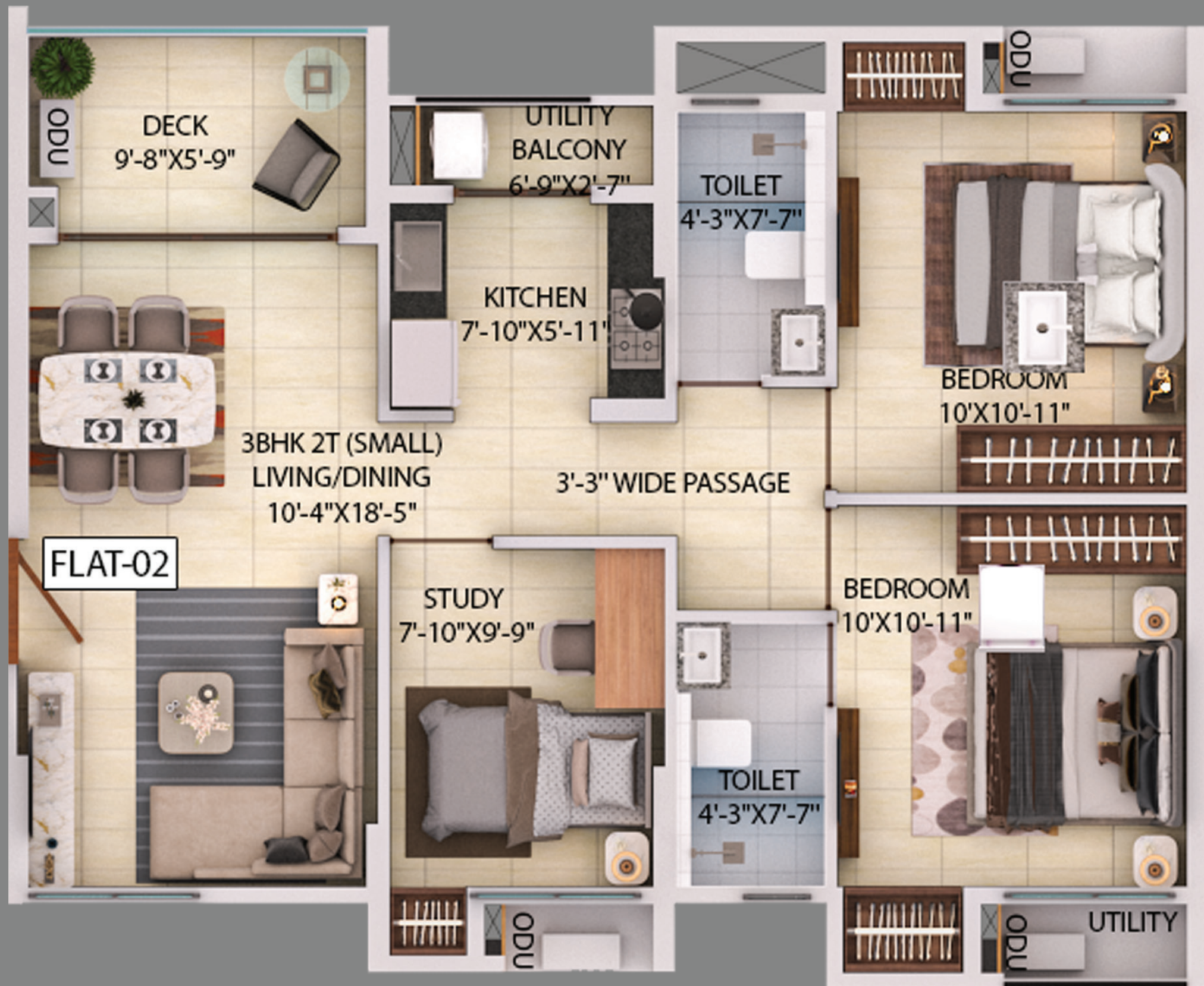
TOWER C - FLAT 2