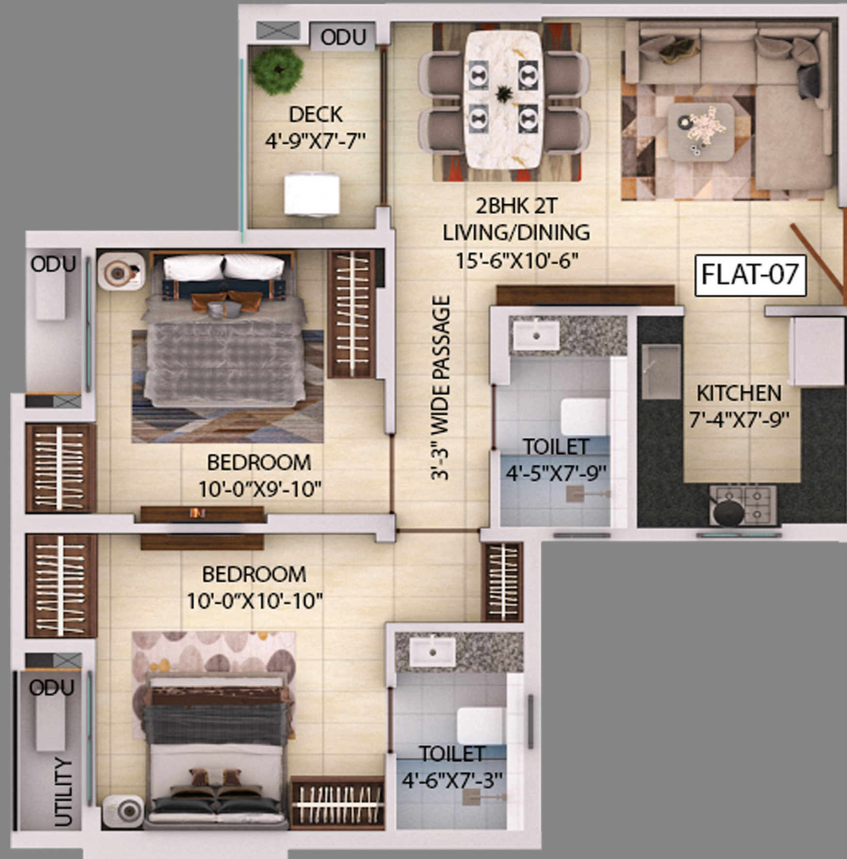
TOWER C - FLAT 7